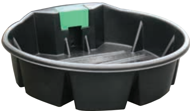
RXTR1200LRB 1200 litre trough - black (2130mm x 580mm deep)