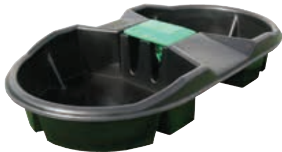
RXTR350LRTB 300 litre trough - black (1935mm x 1100mm x 380mm deep)