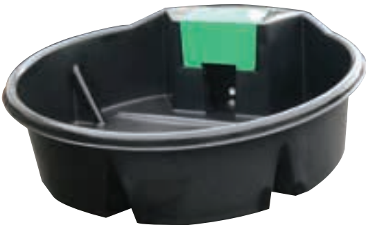
RXTR500LRDB 500 litre trough - black (1620mm x 420mm deep)