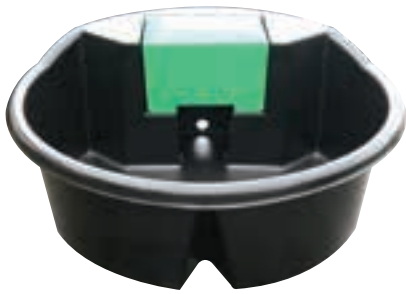
RXTR200LRDB 200 litre trough - black (1180mm x 390mm deep)